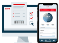
[ Acubiz ]

If an employee, e.g., leaves the company, the company can disable or delete the employee's local IdP user. The employee is then automatically logged out of all the systems or solutions that are synchronized with the company's IdP – including Acubiz. It improves both the data security and the control for the company.